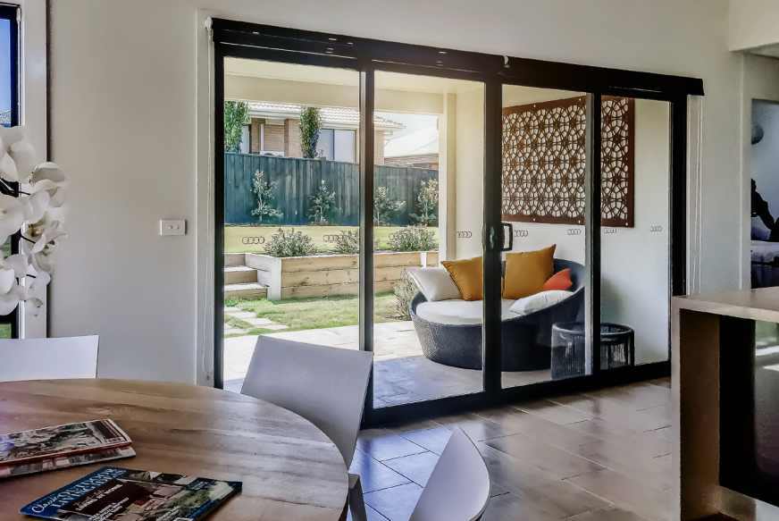
Pictured: Dowell ThermaLine® four panel Sliding door